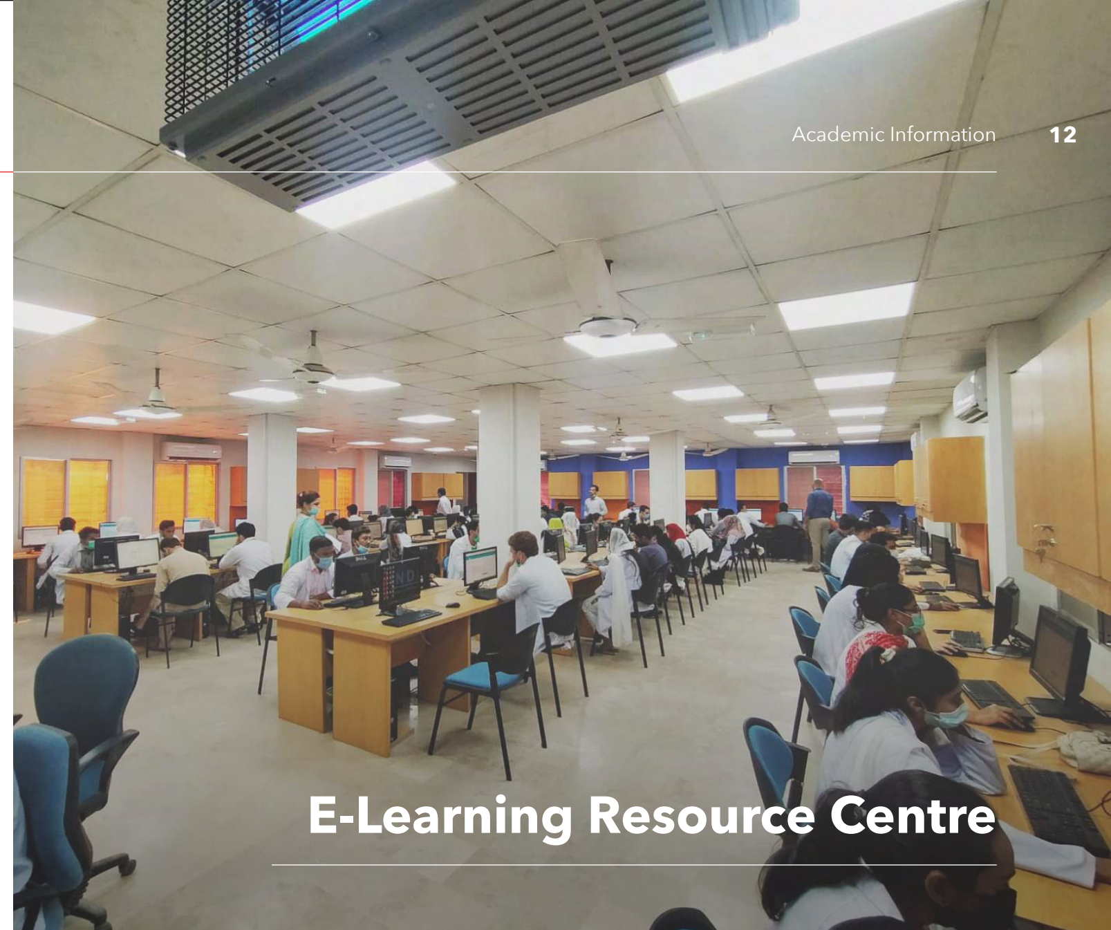
E-Learning Resource Centre

Scholarship and Financial Assistance is available on a need cum merit basis. The assigned Committee selects the student through a transparent screening process.